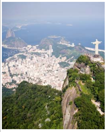
The Portuguese translation headed for Brazil.

"We invite those of you reading this newsletter to submit names of people you consider the leaders and teachers of the future."