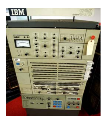
1964: IBM System/360 mainframe computer

an online "Index and Encyclopaedia of The Urantia Book ".