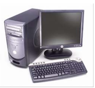
Dell Personal Computer