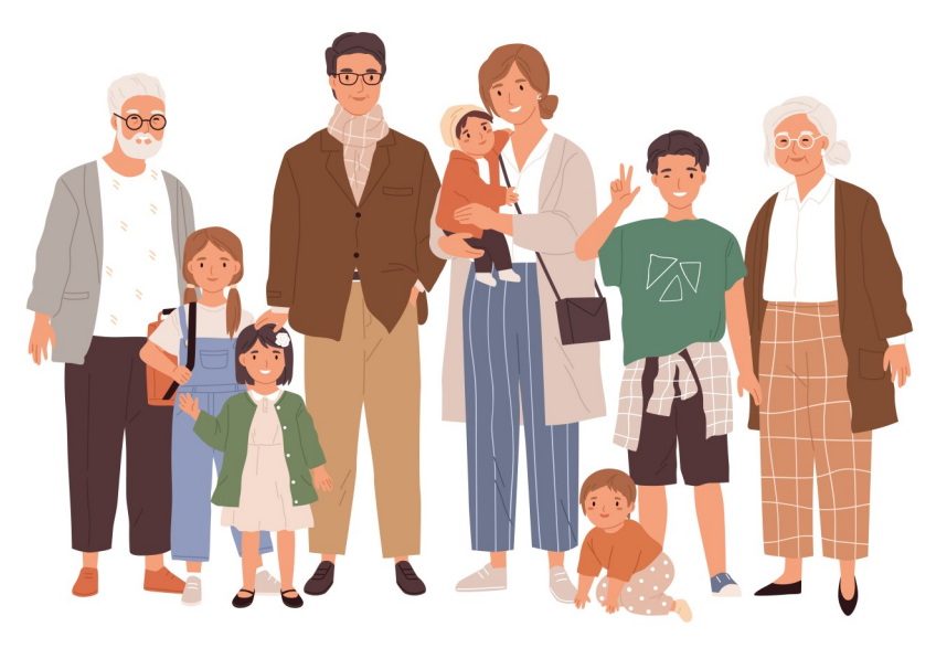
Urantia Foundation Presents