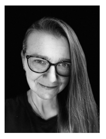
By Krystyna Wardega-Piasecka, Sandnes, Norway

Have you ever wondered, dear readers of The Urantia Book ,