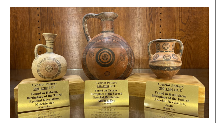
Pottery with three concentric circles at Urantia Foundation

Since those days I have been on the lookout for similar pieces of pottery. And now we have many more such pieces at Urantia Foundation. Importantly, we have in our collection three pieces found