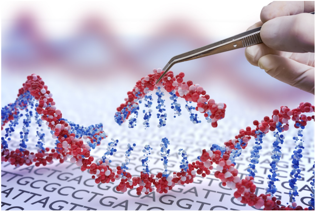
There is still time to submit a proposal for Science Symposium III