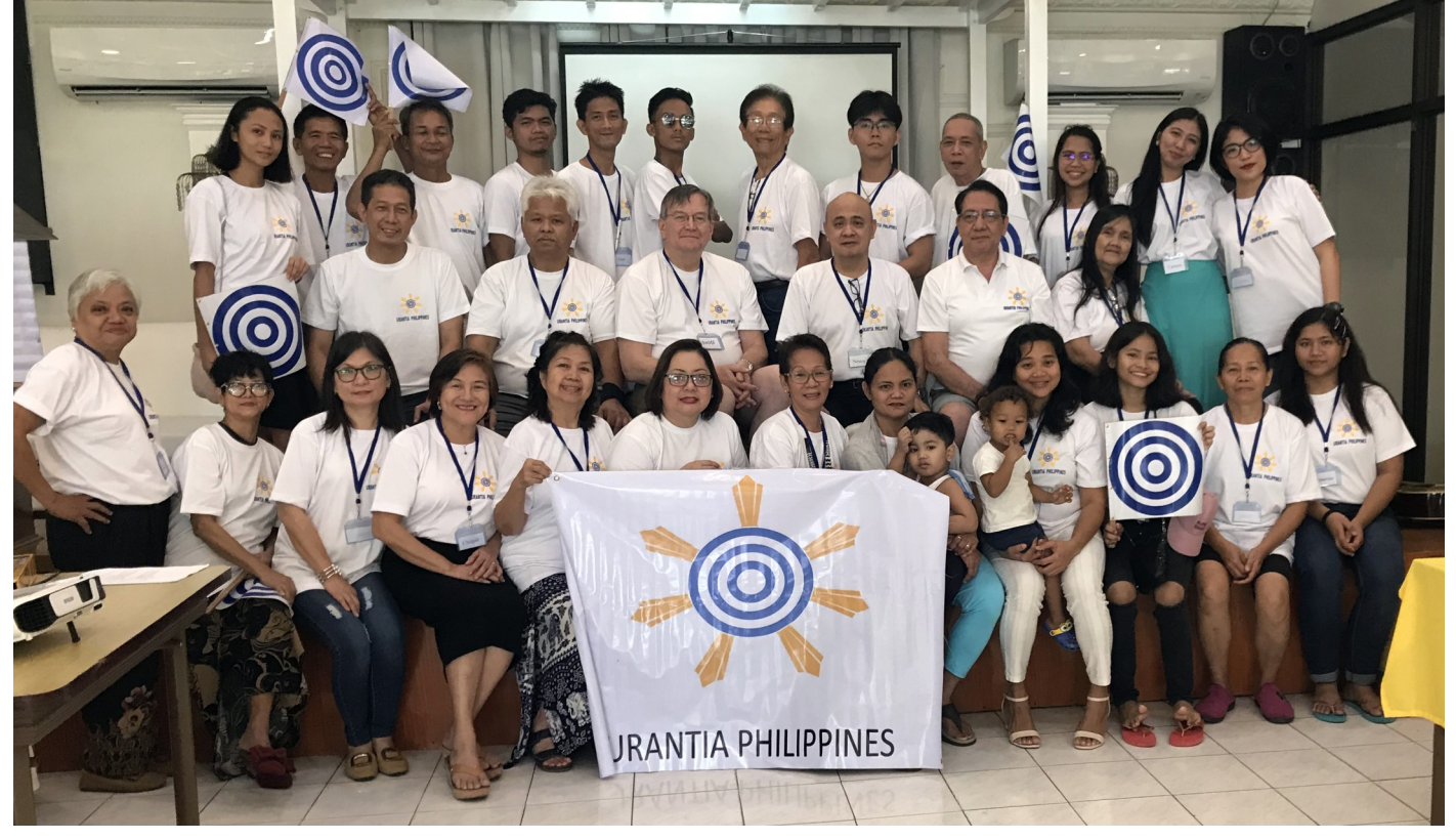
The 2019 Urantia Book Conference in the Philippines

We thank everyone in the Urantia movement for all your support. In unity we can envision that the seeds we are planting now will grow, to bring another leap forward in the future.