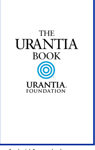
Android App splash screen