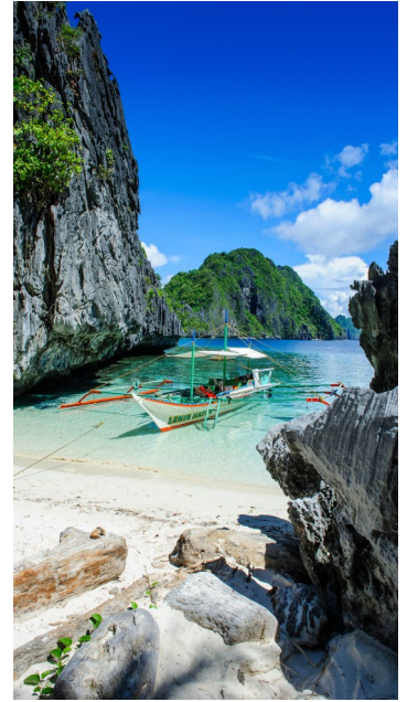
Bacuit Archipelago, Palawan

"Ultimately, there is nothing more inspiring than knowing our Thought Adjusters have been faithfully working within us since childhood, leading the way for us to follow the Father's will. They intimately know our stories and guide us to love and unfold into the true spirit personality reality that we are becoming."