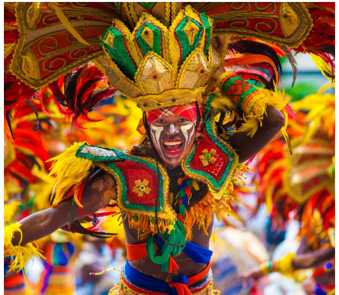
Annual Dinagyang Festival, Iloilo, Philippines