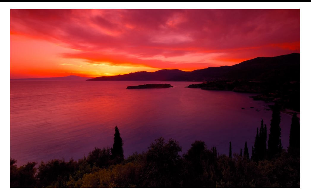
God's doings are all purposeful, intelligent, wise, kind, and eternally considerate of the best good. ~ The Urantia Book , 3:2:8 (47.6)