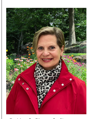
By Line St-Pierre, Québec, Canada

After more than 15 months without being able to meet, would it be possible to create the proper atmosphere in an online retreat?