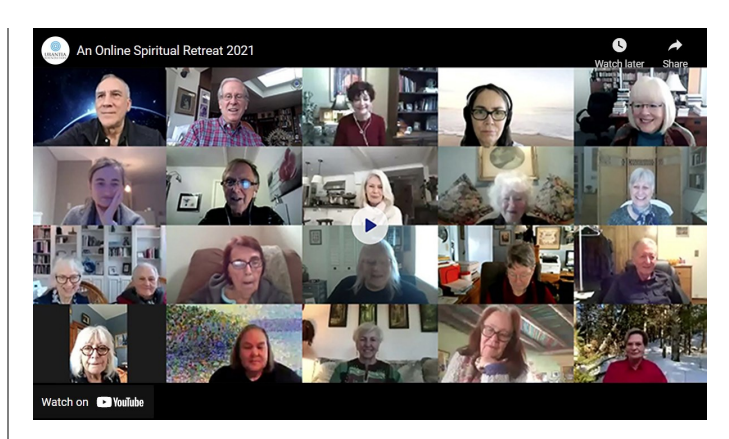
Click Here to See the Video

There were no stories told during the "in-between" times.