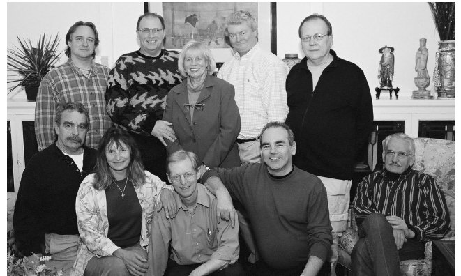
MEMBERS OF INTERNATIONAL SERVICE BOARD

When early readers of The Urantia Book came together to form an organization based on its teachings, they recognized that their Protestant Christian backgrounds could have the undesired effect of creating an