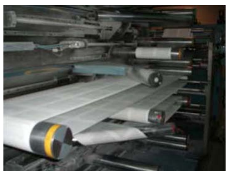
The large roll sheet is cut and folded