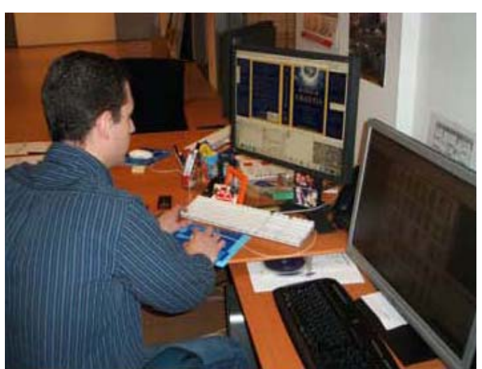
Pre-press operation and plates flashage