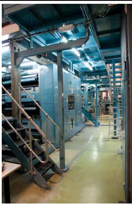
SIMSON Press ground level