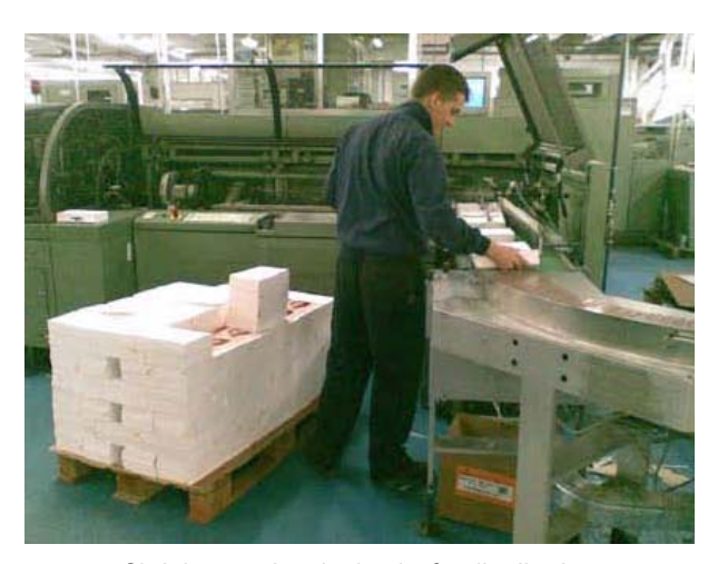
Shrink-wrapping the books for distribution