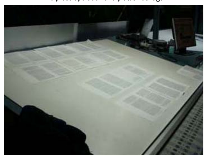
Preparation and checking first pages