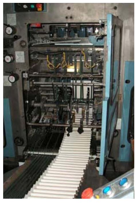
Folios are conditioned for the binding mill