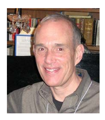
"I decided to dedicate myself to the Truth at all costs."

a little earlier than would have happened otherwise. After a normal and nurturing first seven years, my next few years were increasingly tumultuous and difficult. Maybe not so out of the ordinary. The resolution of all the internal conflicts of those years came when I decided to dedicate myself to the Truth at all costs, and set out to find out for myself what my life was about.