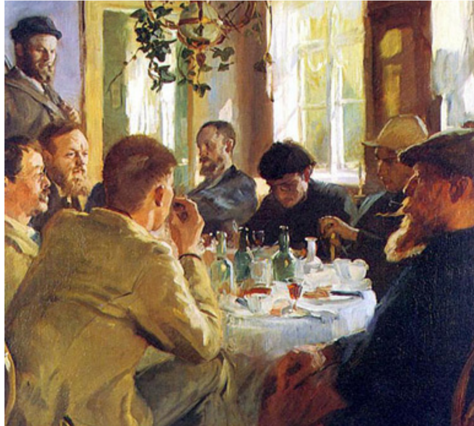
The Artists' Luncheon by Peter Severin Krøyer

In the typical university classroom, the teacher lectures, and the students take notes and regurgitate the contents of the notes on the tests. Such education leads students to passive listening and to memorization. But if students are allowed to ask questions, the