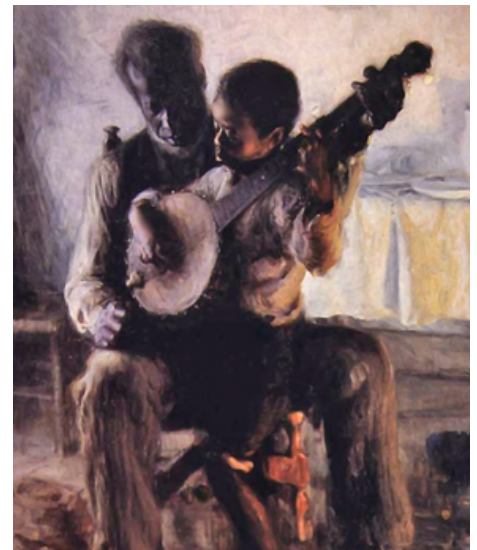
The Banjo Lesson by Henry Ossawa Tanner

it is based on questioning and sharing in a non-invasive, non-coercive, and non-interpretive manner.