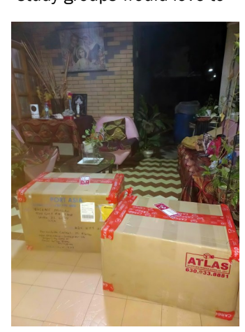
200 Urantia Books

Our various Urantia Book study groups would love to