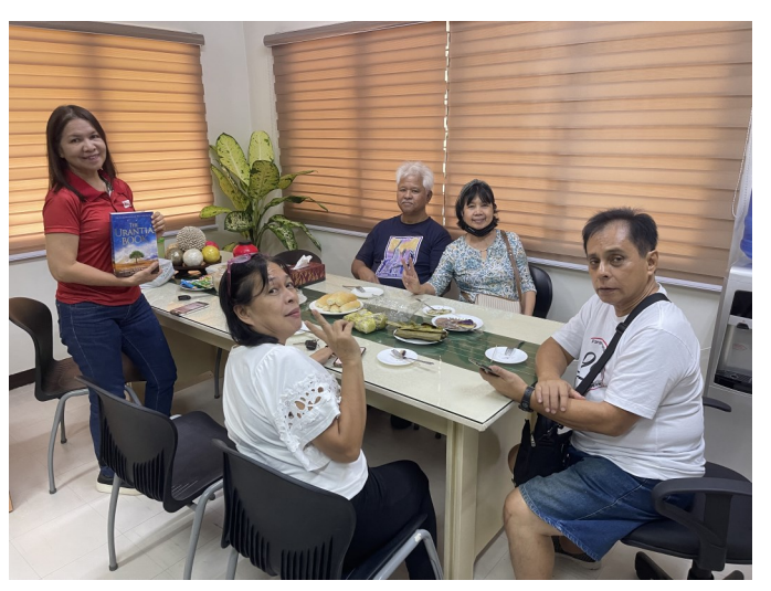
University of Mindanao-Digos