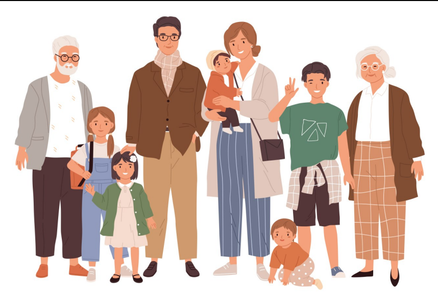
Urantia Foundation Education Committee Presents