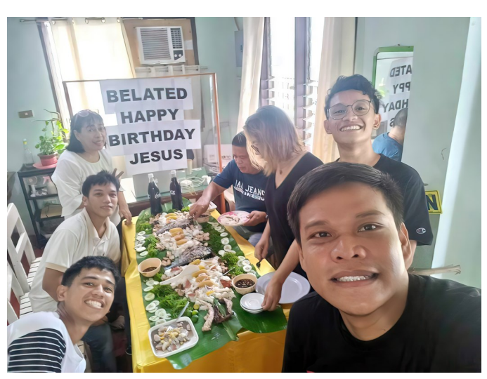
Jesus' Birthday, Digos City