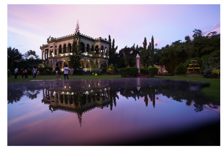
Bacolod City, Philippines

We are pleased to report that we have launched five study groups in different parts of the country and related activities