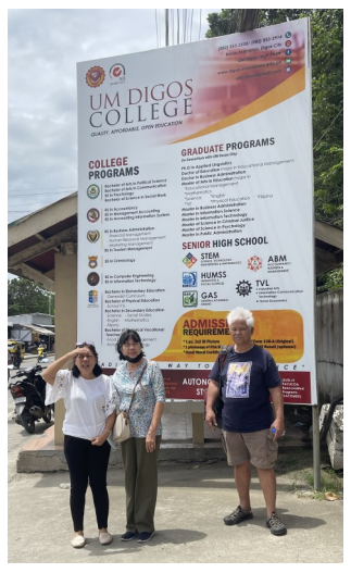
University of Mindanao-Digos

Above all, Urantia Book readers in the Philippines are energized by the spirit of giving and sharing. A palpable sense of brotherhood and sisterhood under the fatherhood of God pervades the air!