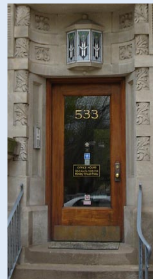
Urantia Foundation headquarters front entry at 533 Diversy Parkway in Chicago.

Urantia Book Internet School (UBIS) is part of the Urantia Foundation, a non-profit, educational association. We are not a church or an organized religion, nor is that our intent. UBIS does not express opinions or take positions on political, social or economic issues. We welcome people of all faiths, races, and nationalities seeking spiritual fellowship. We view true religion as the personal spiritual experience of each individual. This internet-based school is a group endeavour of people inspired by the teachings of The Urantia Book . We wish to cooperate with all religionists to pursue the spiritual, social, and moral advancement of our world. While people’s beliefs may differ, our faith and destiny are the same, for we are all children of God. Spiritual uniformity is not our goal, spiritual unity is. Please join us!